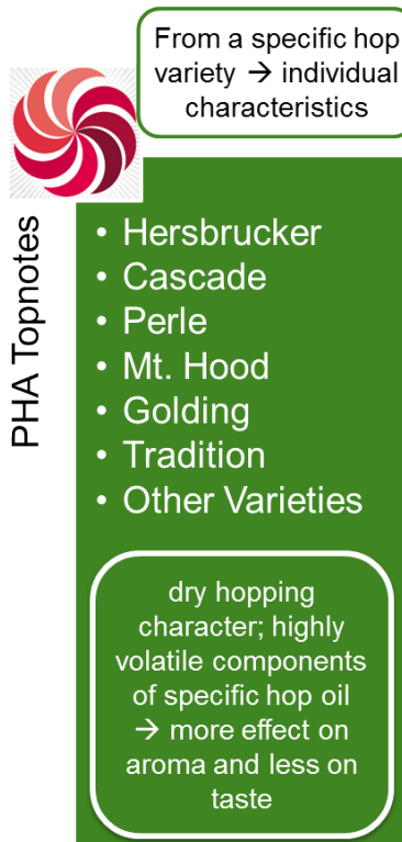
Figure 1: PHA® Topnotes

PHA® Topnotes products are a hop extract in an aqueous propylene glycol carrier, produced by a proprietary physical separation process. It is considered as GRAS (FEMA no. 2580 - Hops, oil). Propylene glycol is registered as a food additive according to Annex II of EU Reg 1333/2008 as well as E1520 and PG is a permitted carrier for flavours as per regulation 2006/52/EC. PHA® products are exclusively supplied worldwide by BarthHaas.